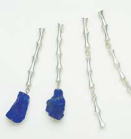
Hidemi Asano Jewellery 5 Peacock Yard hidemiasano.com