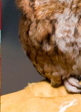
Many Hoots Rescued birds of prey Iliffe Yard manyhoots.org