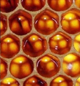
Bee Urban Beehive Peacock Yard beesurban.co.uk