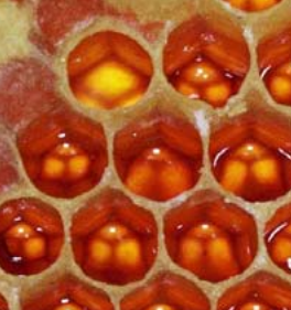
Bee Urban Beehive Peacock Yard beesurban.co.uk