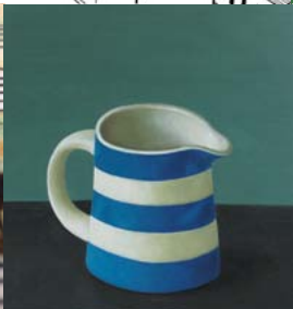
Faranak Fine Art 21A Iliffe Yard faranakfineart.co.uk