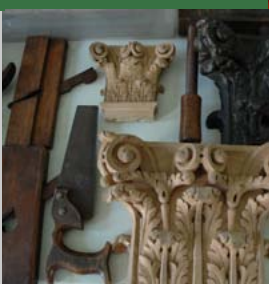
Stephen Bull Historic building repairs Peacock Yard stephenbull.co.uk