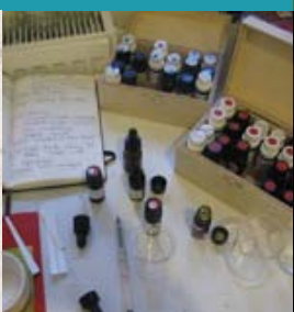
Veronica Hendry Round Midnight Perfume Clements Yard veronicahendry.co.uk