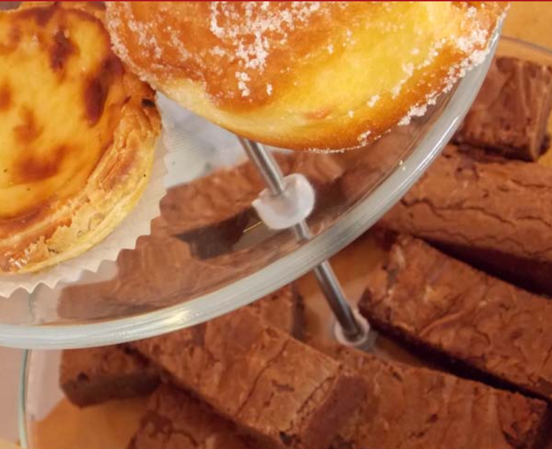
Electric Elephant Café Iliffe Yard electric-elephant.co.uk