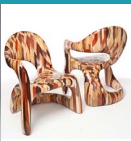
YardSaleProject Design Art Object Clements Yard yardsaleproject.co.uk