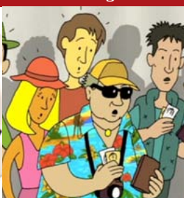
Dacapo Film, video & animation 18 Iliffe Yard dacapo.co