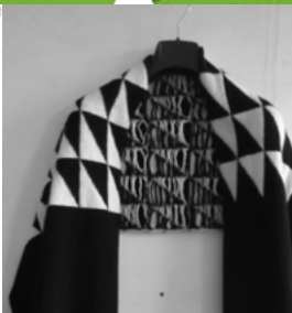
Kathleen Chapple Experimental knitting 18a Iliffe Yard kathleenchapple.co.uk