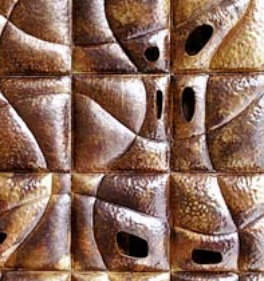
Adaesi Ukairo Sculpture 3 Clements Yard ukairo.com