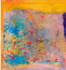
Frank Bowling Fine Art 12 Peacock Yard frankbowling.com