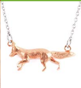
Alex Monroe Jewellery Iliffe Yard alexmonroe.com