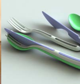
Cairnyoung Industrial Design Clements Yard carnyoung.com