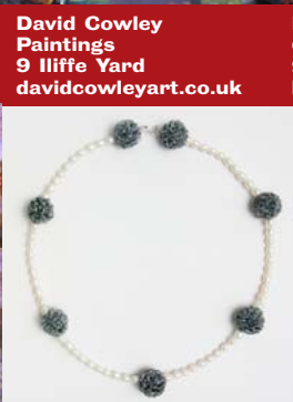
Reneé Pfister Jewellery Iliffe Yard reneepfister.com